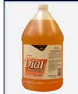
Dial Pump Soap (16OZ) $2.55 ea.