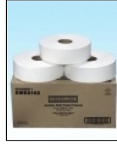
JUMBO 9" TOILET TISSUE 12/CS $37.25